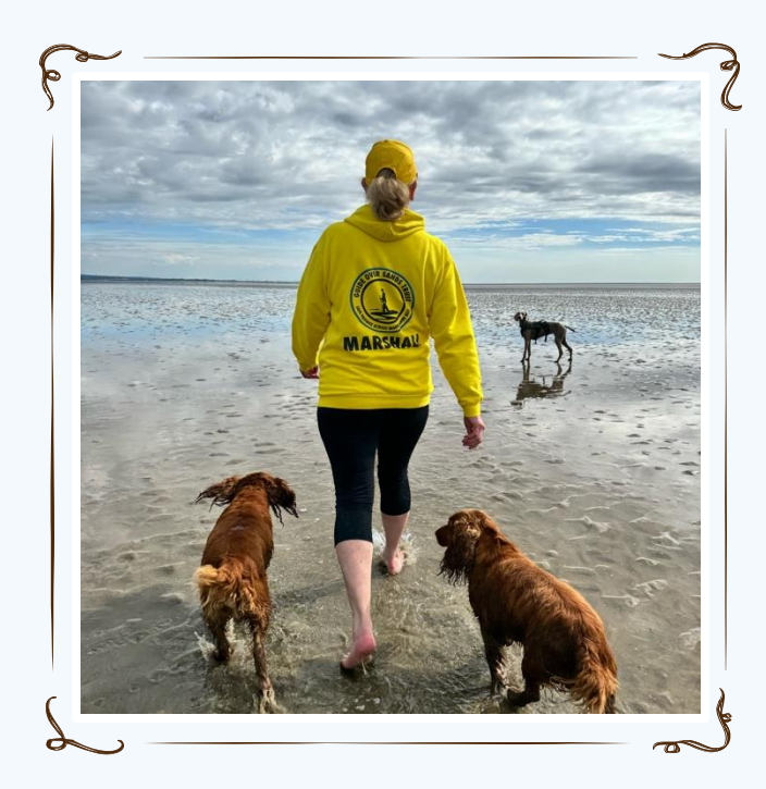
Without them our walks could not go ahead