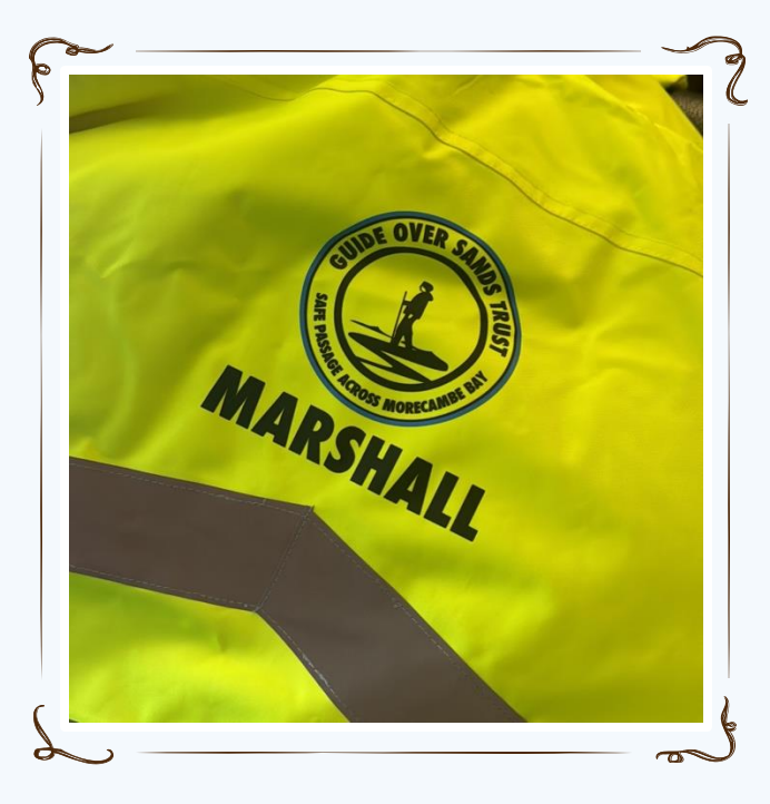
So please be polite at all times we will not tolerate any bad language or abuse off anyone