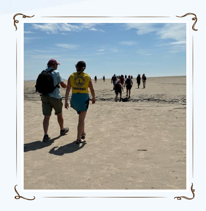
Our team give up their own time to help us do the walks