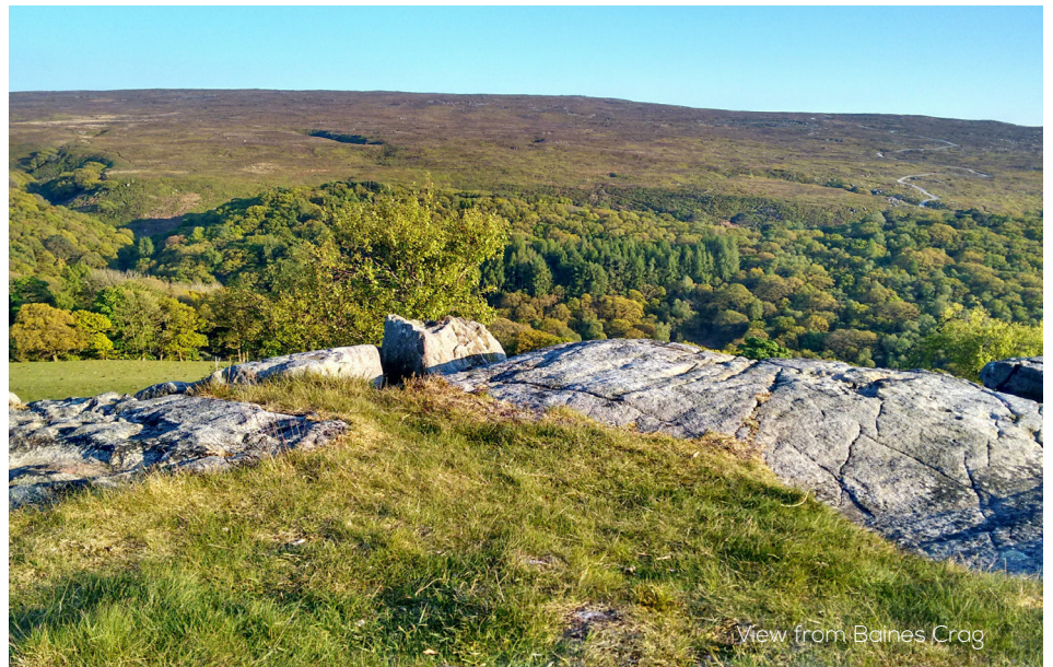
View from Baines Crag

Lancaster's 'other' AONB is the Forest of Bowland; Lancaster's share of this is larger than the whole of Arnside - Silverdale and includes the highest fells. It's above all an area of sprawling heather moorland, punctuated by rocky outcrops and dissected by sheltered valleys. This walk provides a taste of these contrasts and gives some magnificent, far reaching views into the bargain.