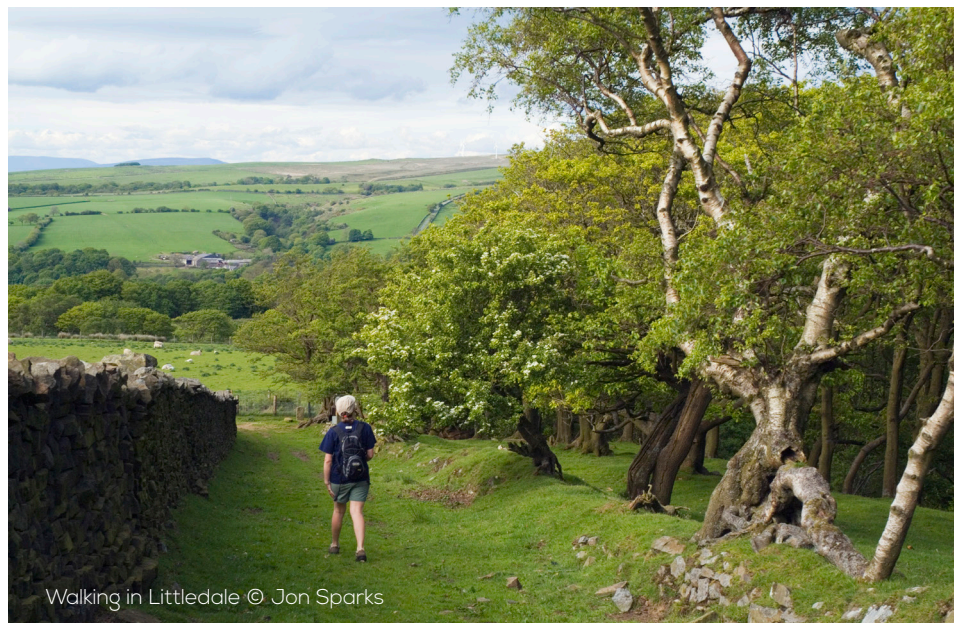
Walking in Littledale