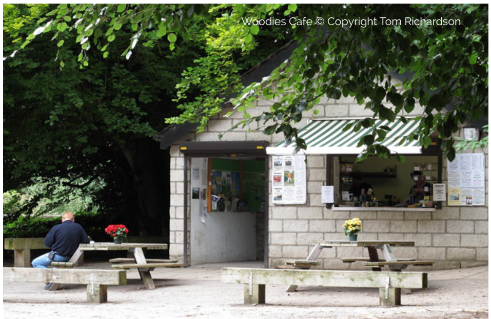
Woodies Cafe