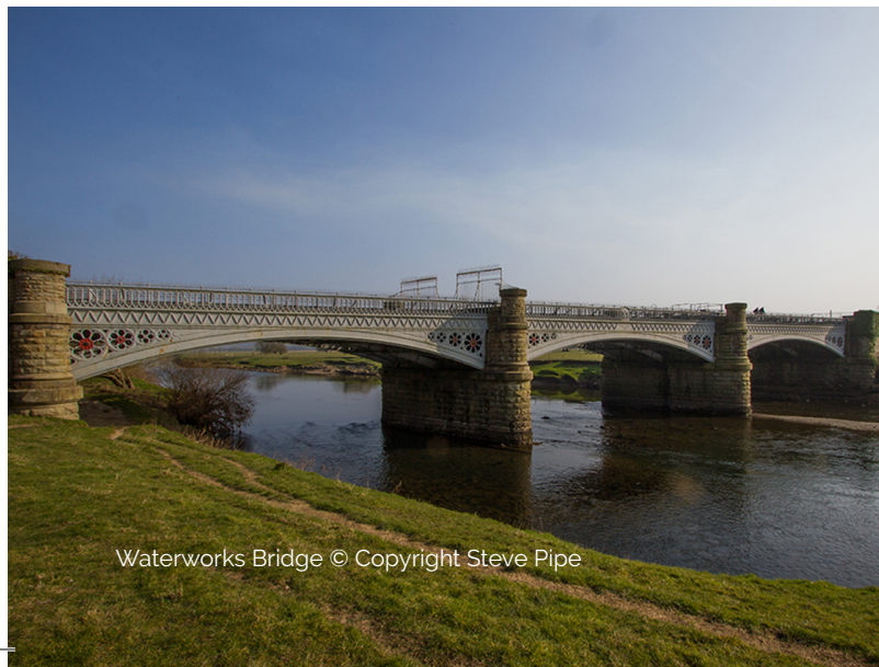
Waterworks Bridge