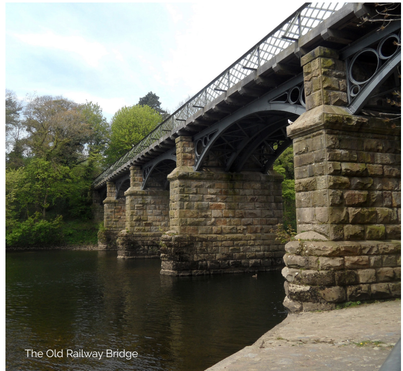
The Old Railway Bridge

Having walked for approx. 1 mile, you will pass a weir on your L, then shortly afterwards you will reach the Waterworks Bridge. Cross this bridge and double back towards Crook O'Lune car park, keeping the river on your L, for approx. 1.3 miles. Climb steps on your R to reach the car park. LOOK OUT FOR: The Three Bridges – the Crook O'Lune road bridge; the former railway bridge now used by pedestrians and cyclists; and the Waterworks Bridge at the farthest point of this route.