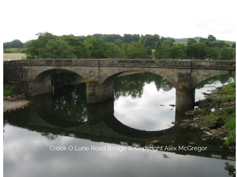
Crook O'Lune Road Bridge