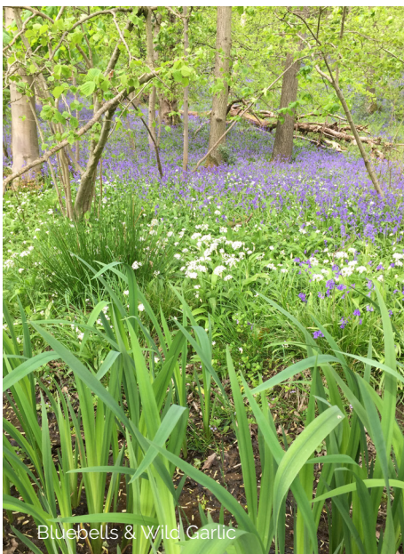
Bluebells & Wild Garlic