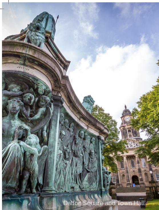
Dalton Square and Town Hall