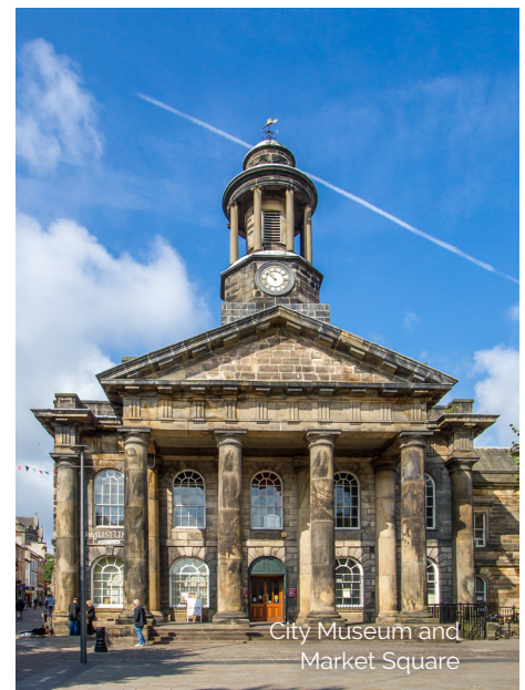
City Museum and Market Square